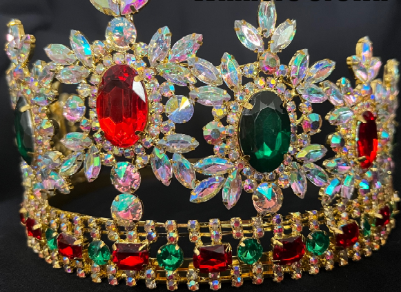
8 Age Group Winners Crown

Reservoir Community Center Brandon, Mississippi