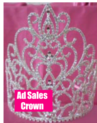
An Example of an ad sales crown. Styles may vary.

Any contestant selling 3 pages may enter the pageant free! (Smaller ads can added up to make full pages, can be 1/4, 1/2 as long as the grand total EQUALS 3 full pages.) Your required 1/4 page ad IS included if you decide to sell the 3 pages. Any contestant selling 5 pages may enter the pageant free and receive a 3 foot tall trophy and beautiful Rhinestone Ad Sales Crown for his/her hard work. For any contestant selling over 7 pages will receive a Miss Magnolia State scepter in addition to their crown and trophy. For any contestant selling 10 pages this year, they will receive their ad sales crown, a GIANT 5 foot tall deluxe trophy, a Miss Magnolia State scepter and $100 cash back. ALL ADS MUST BE TURNED IN BY YOUR DEADLINE TO MEET THE PRINTER'S DEADLINE. If you are selling multiple pages of ads and need more time, contact the director for a deadline extension.